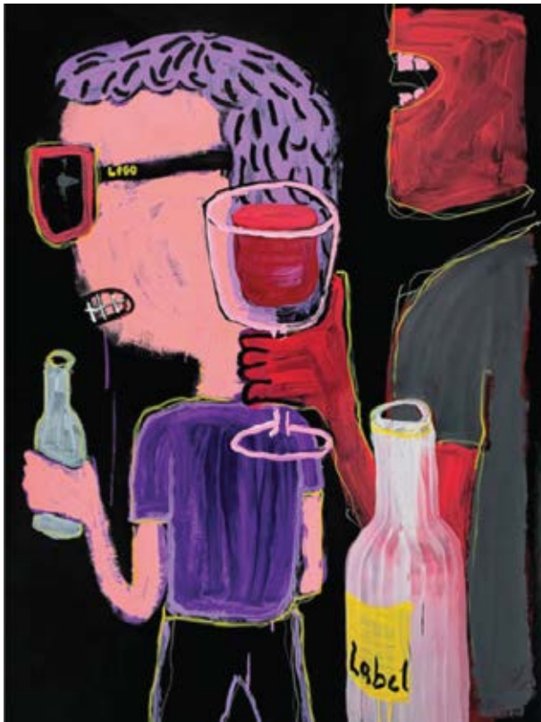
Beer & Wine, 2022 Acrylic paint on canvas 190 × 140 cm