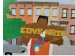
Adio Raheem, 2022 Oil paint on paper 21 x 29.7 cm