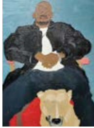
DMX, 2021 Oil paint on paper 29.7 x 21 cm