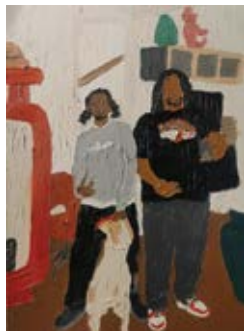
Smi & Monte, 2021 Oil paint on canvas 42 x 29.7 cm