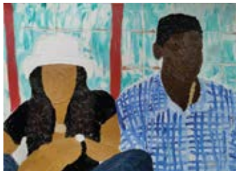
He Got Game, 2021 Oil paint on paper 29.7 x 42 cm