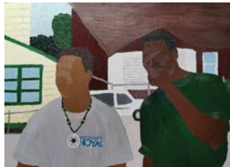
Boyz in the Hood, 2021 Oil paint on canvas 42 x 59.4 cm