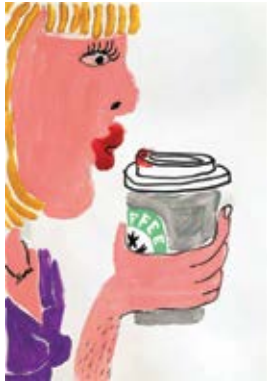
Coffee to Go, #2 (sketch), 2022 Acrylic paint and marker on paper 42 × 29,7 cm