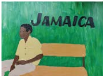
Jamaica Nice, 2021 Oil paint on paper 29.7 x 42 cm