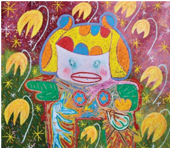
Little Fighter Girl in Weeping Lunar Tulip Garden, 2022 Oil stick, acrylic and pencil on canvas 142.2 x 162.5 cm