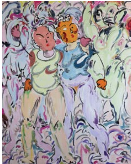
Bystander Nr.2, 2022 Oil color and acrylic on canvas 140 x 110 cm