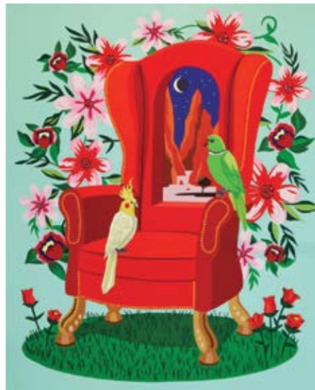
A World Within a Red Chair, 2022 Acrylic on canvas 120 x 100 cm