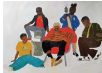
The Internet, 2021 Oil paint on paper 29.7 x 42 cm