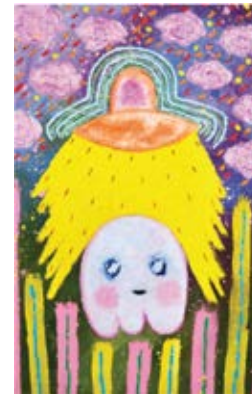
Ghost Abduction with Yellow and Pink Wobbles, 2022 Oil stick and acrylic on canvas 76.2 x 45.7 cm