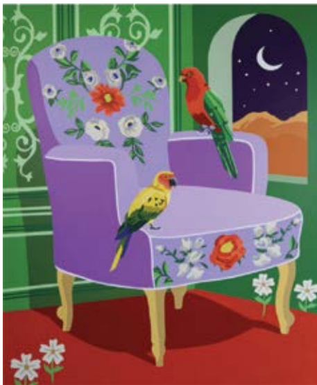
Purple Chair Desert Moon, 2022 Acrylic on canvas 110 x 120 cm