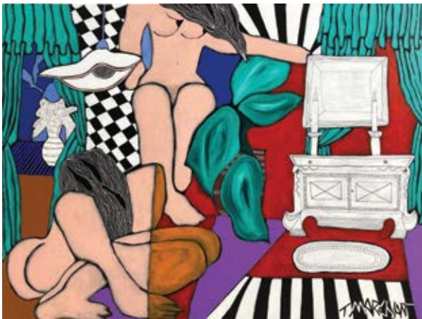
Mementos III, 2022 Acrylic on canvas 96 x 122 cm