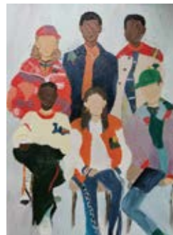
Lacoste, 2021 Oil paint on paper 42 x 29.7 cm