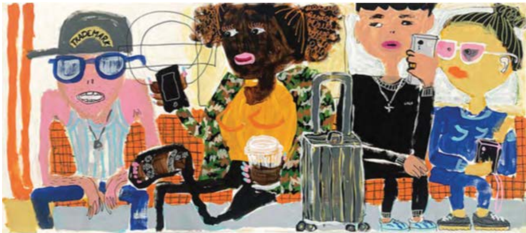
Overground (sketch), 2022 Acrylic paint and marker on paper 160 × 70 cm