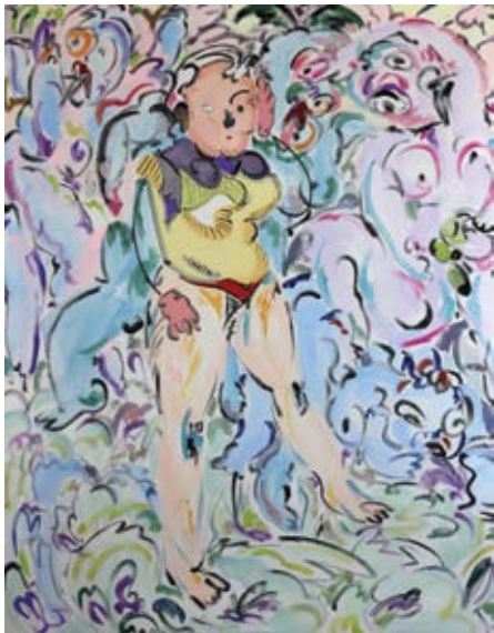
Bystander Nr.1, 2022 Oil color and acrylic on canvas 140 x 110 cm