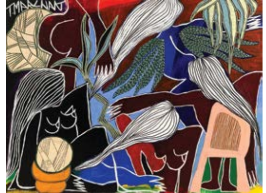
Les Belles III, 2020 Acrylic on canvas 76 x 101 cm