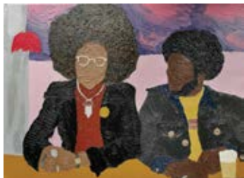
Blackkkklansman, 2021 Oil paint on paper 29.7 x 42 cm