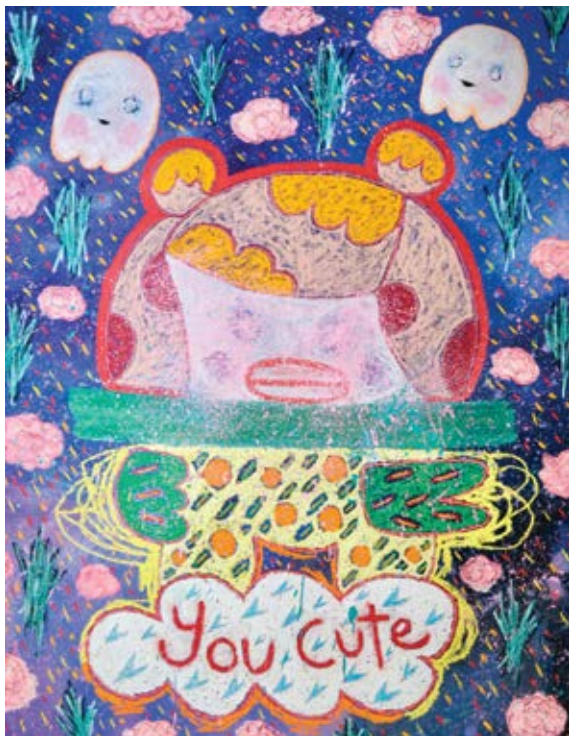
You Cute Pajama Girl, 2022 Oil stick, acrylic and pencil on canvas 162.5 x 127 cm