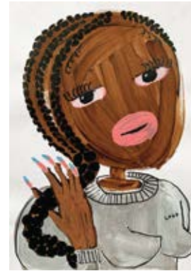
Beautiful Girl #2 (sketch), 2022 Acrylic paint and marker on paper 42 × 29,7 cm