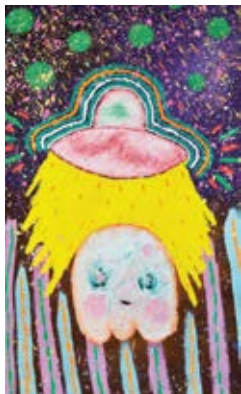
Ghost Abduction in a Wobbly Garden, 2022 Oil stick, acrylic and pencil on canvas 76.2 x 45.7 cm