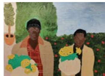
Jimmie & Montgomery, 2021 Oil paint on paper 29.7 x 42 cm