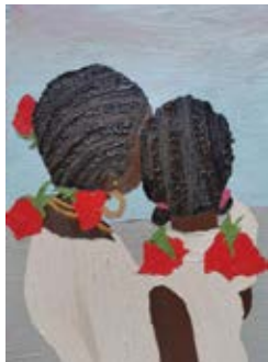
Motherhood, 2021 Oil paint on paper 42 x 29.7 cm