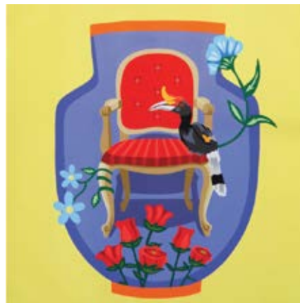
Little Purple Vase with Chair, 2022 Acrylic on canvas 80 x 80 cm