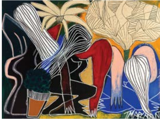
Les Belles I, 2020 Acrylic on canvas 76 x 101 cm