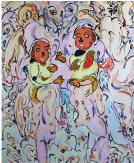
Kidnapping Twins, 2022 Oil color and acrylic on canvas 160 x 130 cm