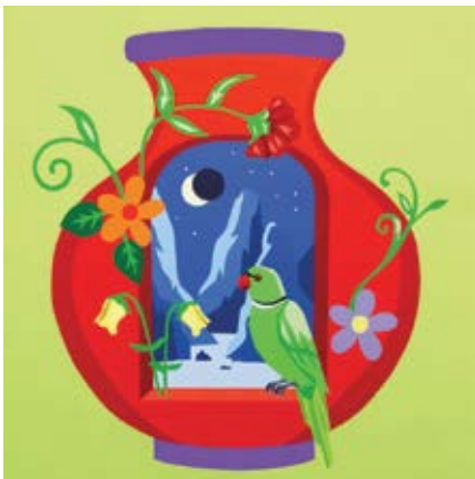
Little Red Vase with Window, 2022 Acrylic on canvas 80 x 80 cm