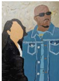
DMX & Aaliyah, 2021 Oil paint on canvas 42 x 29.7 cm