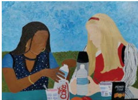
Clueless, 2022 Oil paint on canvas 42 x 59.4 cm