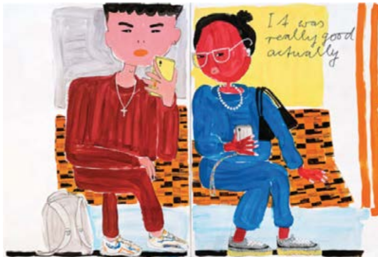
It Was Really Good Actually., 2022 Acrylic paint and marker on paper 120 × 180 cm (diptych)