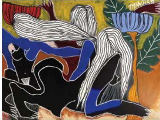
Les Belles II, 2020 Acrylic on canvas 76 x 101 cm