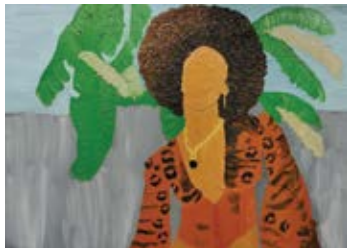
Groovin, 2021 Oil paint on paper 29.7 x 42 cm