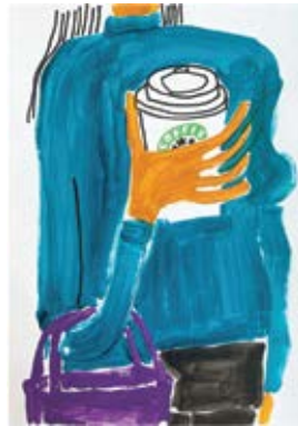
Coffee to Go, #1 (sketch), 2022 Acrylic paint and marker on paper 42 × 29,7 cm