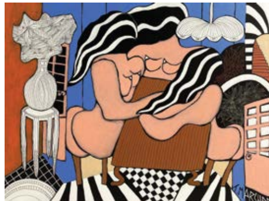
Mementos IV, 2022 Acrylic on canvas 76 x 101 cm