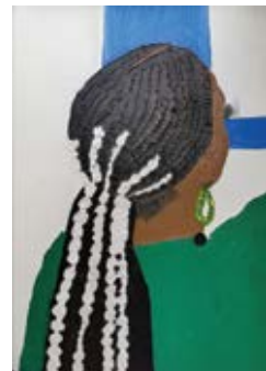
Girl in Green, 2020 Oil paint on paper 42 x 29.7 cm