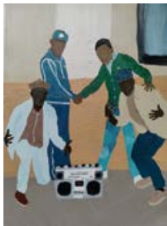
NYC, 2022 Oil paint on paper 42 x 29.7 cm