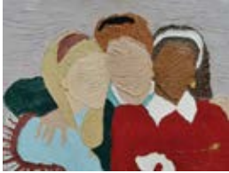
Cher, Tai & Dionne 2020 Oil paint on paper 21 x 29.7 cm