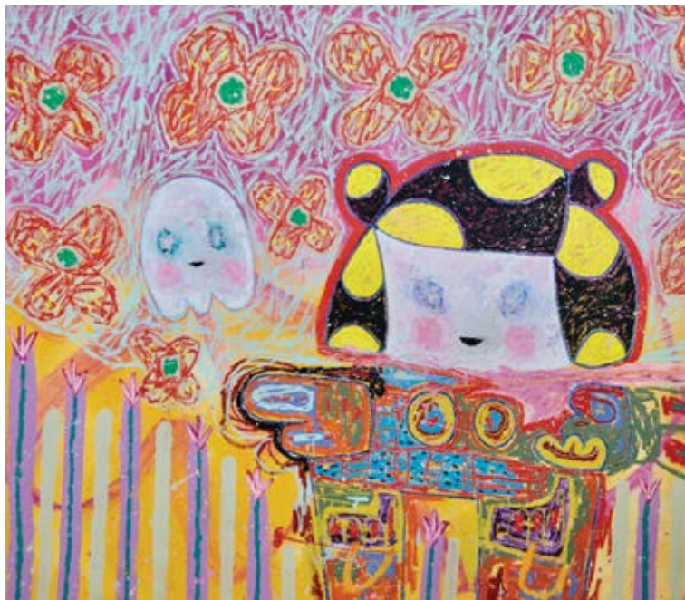
Pajama Girl and Ghost Buddy with Floating Flowers, 2022 Oil stick, acrylic and pencil on canvas 152.4 x 162.5 cm