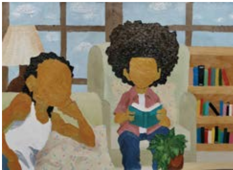
Huey & Riley, 2022 Oil paint on canvas 42 x 59.4 cm