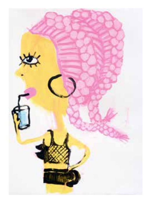
The Pink Pigtails, 2022 Acrylic paint on canvas 90 × 65 cm