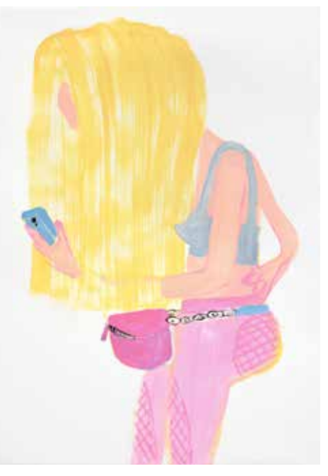
The Pink Leggings, 2022 Acrylic paint on on canvas 90 × 65 cm

Don't Call me Baby, 2022 Acrylic paint on canvas 90 × 65 cm