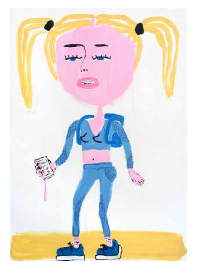
Important Message #2, 2022 Acrylic paint on on canvas 180 × 125 cm