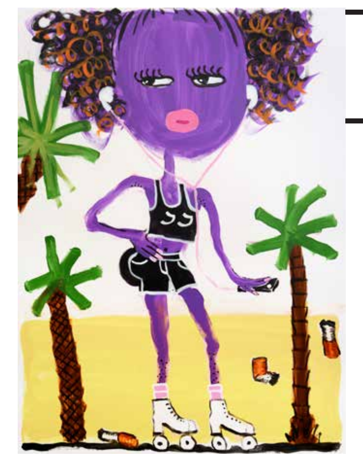
Roller Girl #3, 2022 Acrylic paint on on canvas 190 × 140 cm