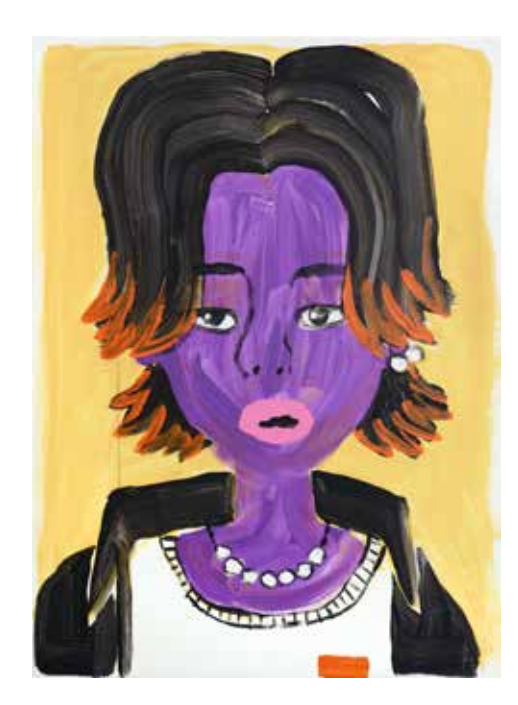
Asian Boy with Pearl Earrings #1, 2022 Acrylic paint on canvas 90 × 65 cm