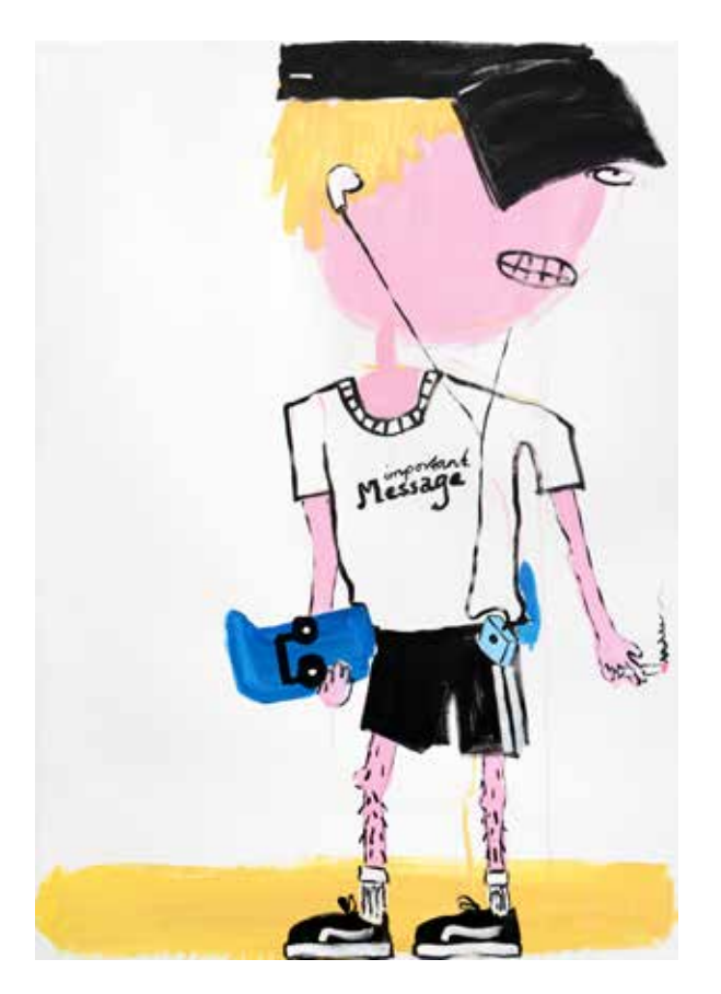
Important Message #1, 2022 Acrylic paint on on canvas 180 × 125 cm