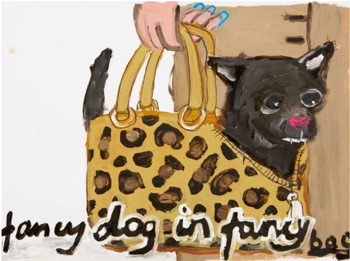
Katharina Arndt Fancy dog in fancy bag , 2024 Acrylic on paper 42 x 59,4 cm