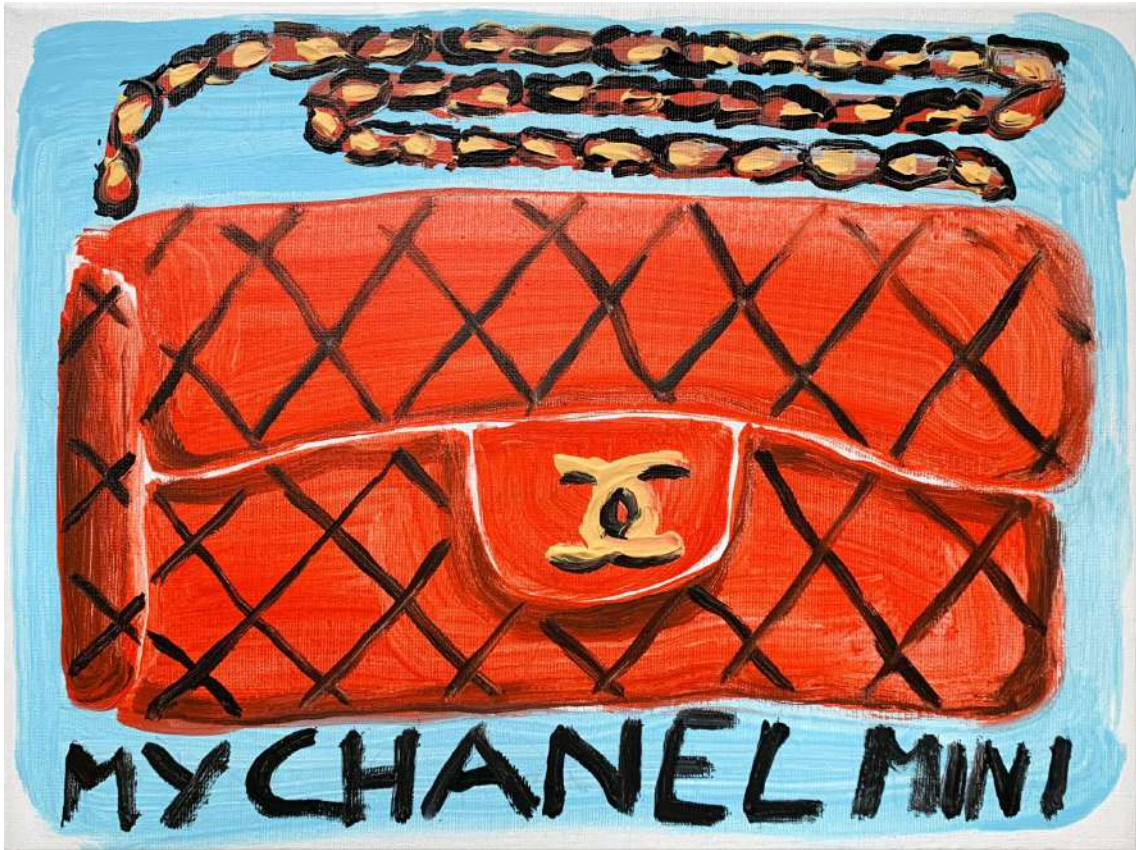
Katharina Arndt My Chanel mini , 2024 Acrylic on canvas 30 x 40 cm