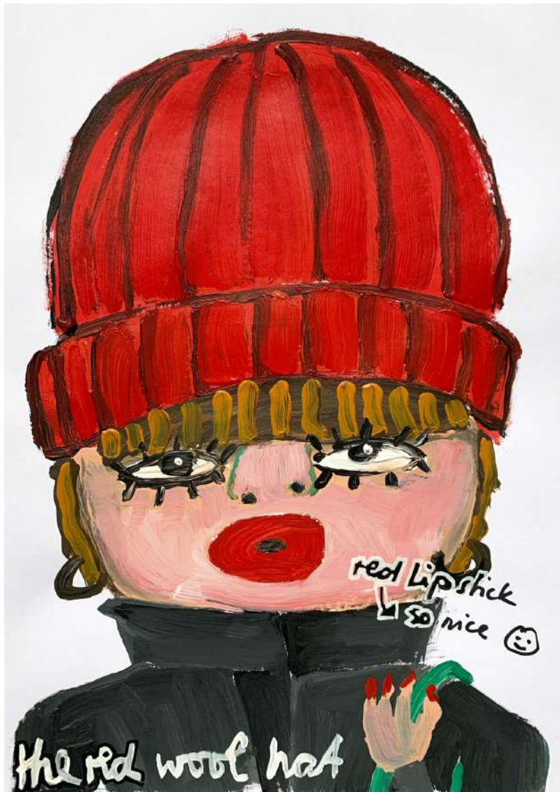
Katharina Arndt The red wool hat (sketch) , 2024 Acrylic on paper 42 × 29,7 cm