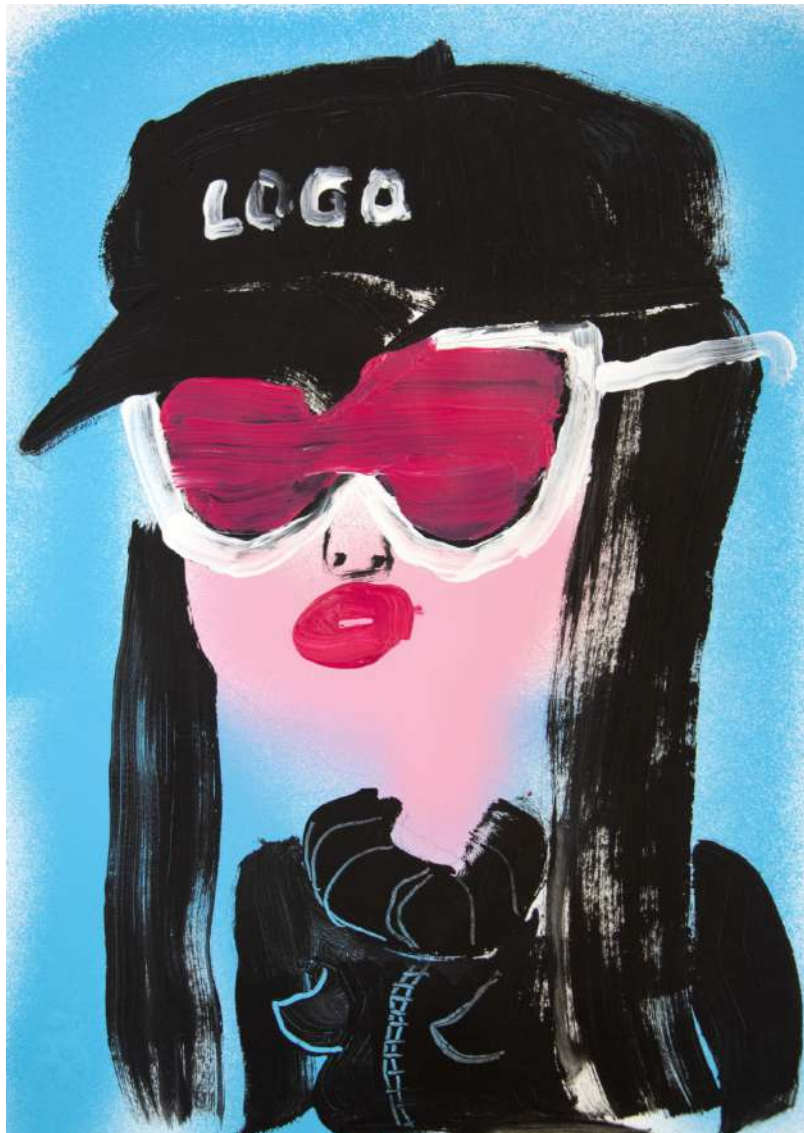
Katharina Arndt The pink sunglasses , 2024 Acrylic on paper 42 x 29,7 cm