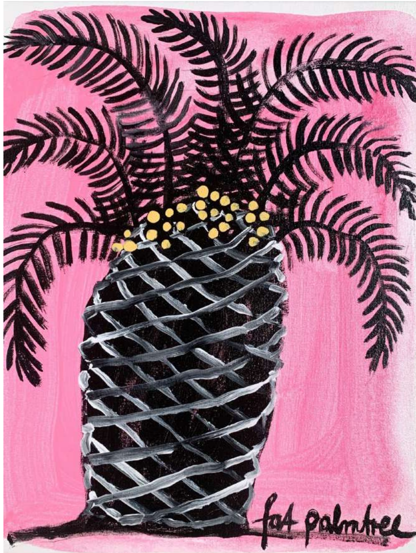
Katharina Arndt Fat palmtree , 2023 Acrylic on canvas 41 x 33 cm