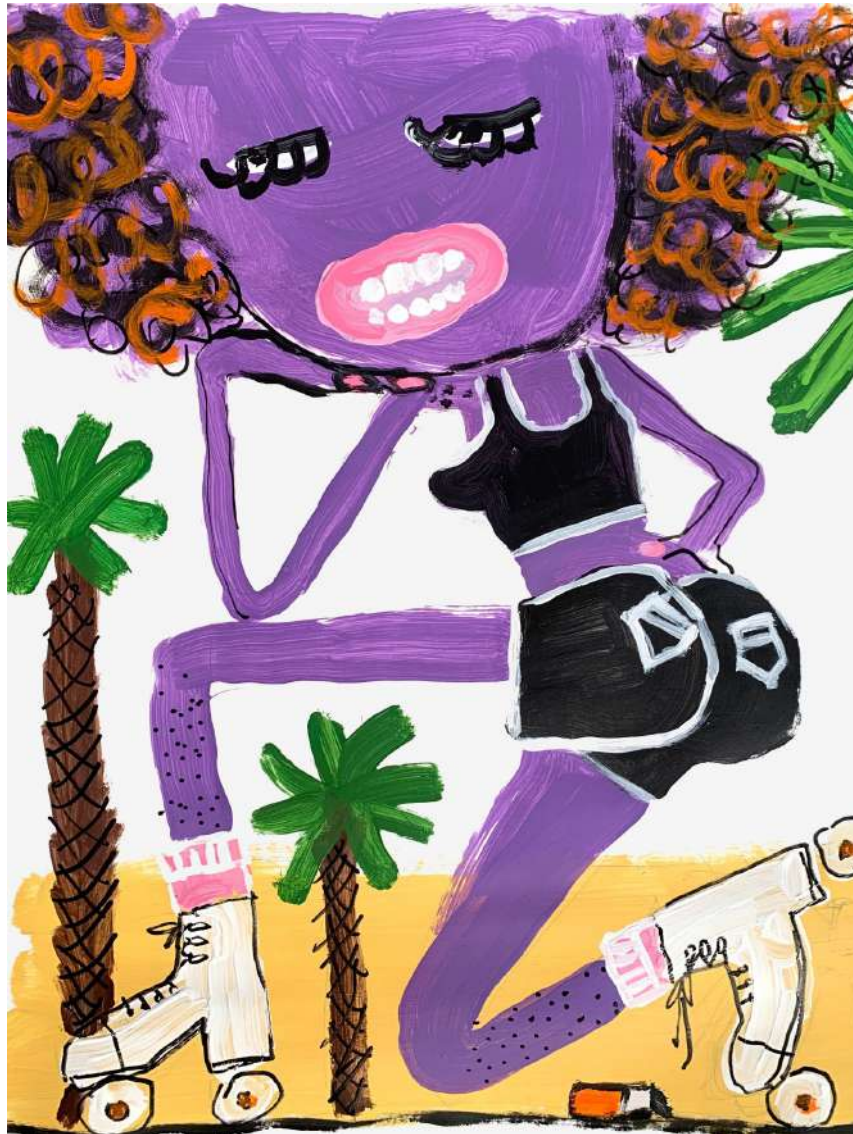
Katharina Arndt Roller Girl #1 (sketch) , 2022 Acrylic paint and marker on paper 53,2 × 42 cm