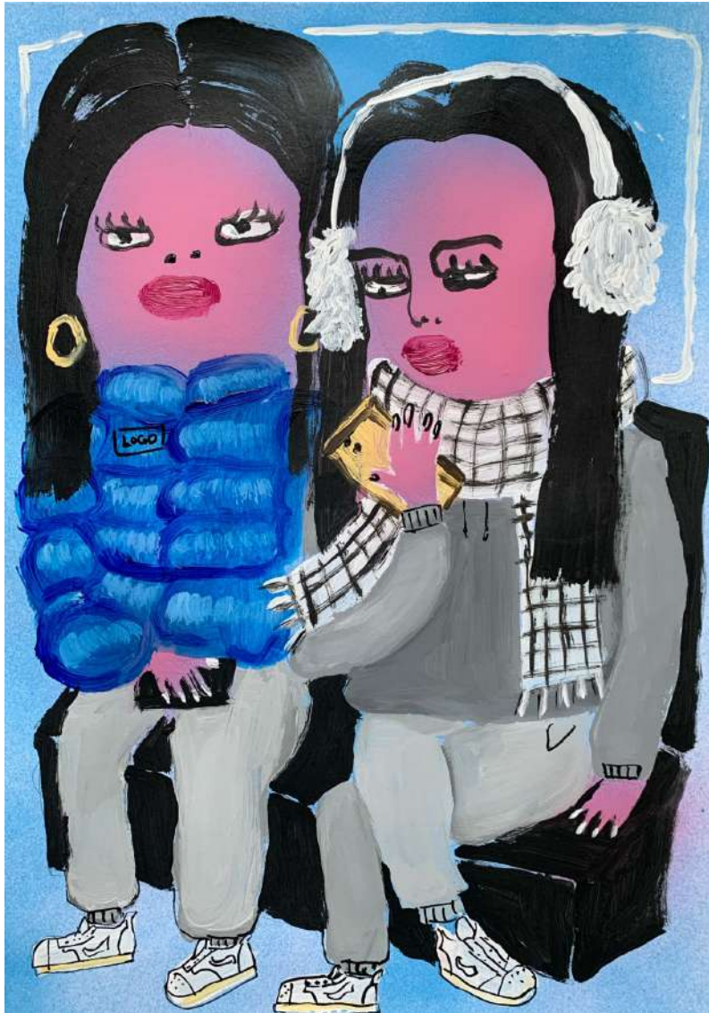
Katharina Arndt Girls with grey Jogging pants (sketch) , 2024 Acrilico su carta 42 x 29,7 cm