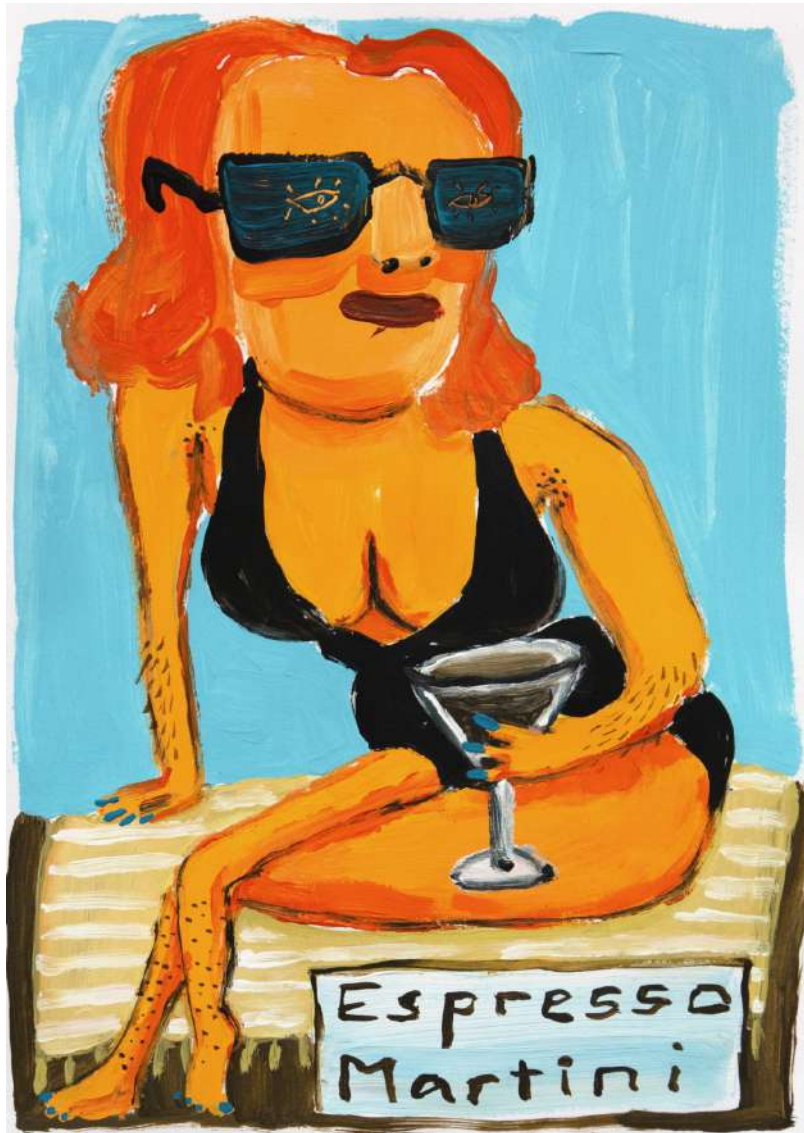
Katharina Arndt Espresso Martini #2, 2024 Acrylic on paper 42 × 29,7 cm