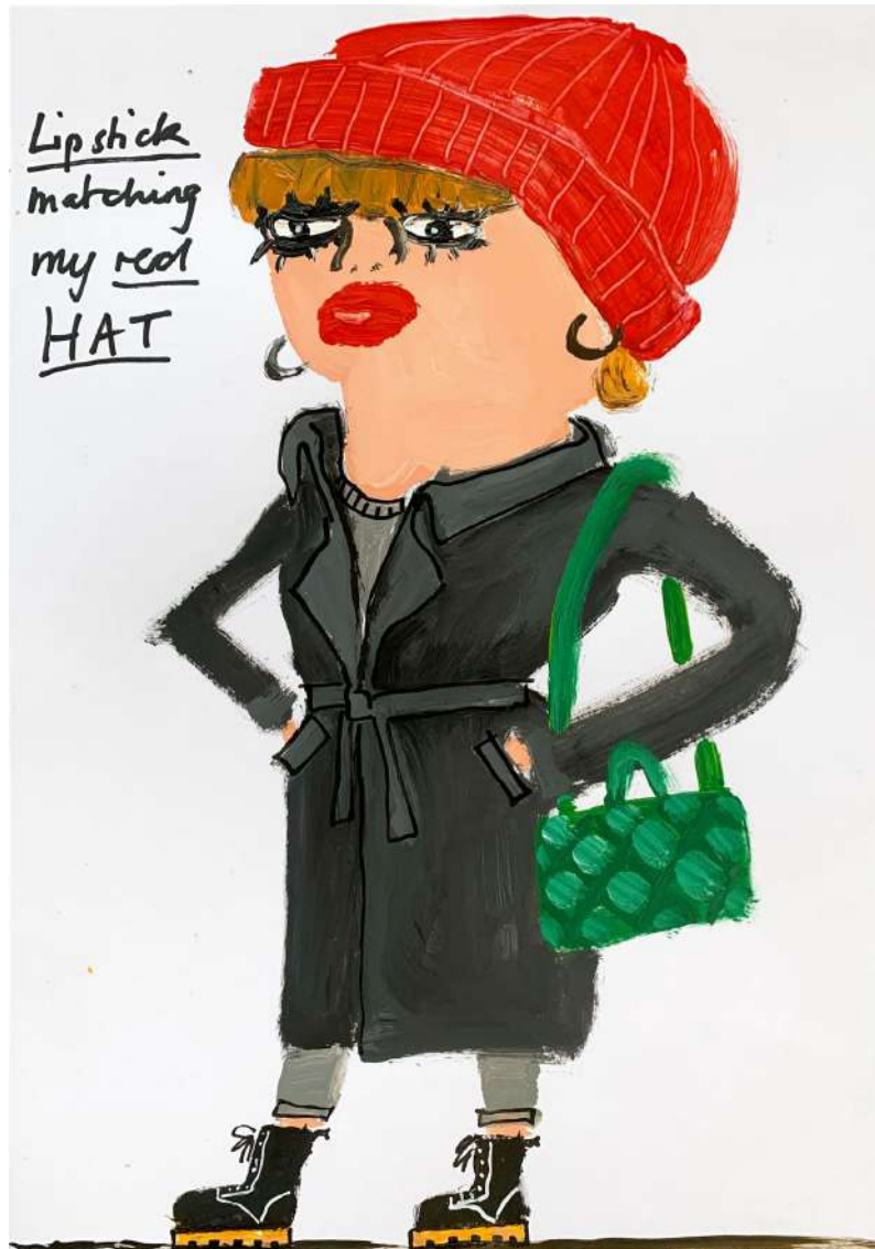
Katharina Arndt Red Lipstick (sketch) , 2024 Acrylic on paper 42 x 29,7 cm