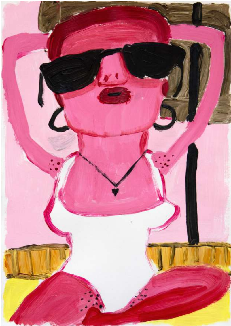
Katharina Arndt Julia #15 , 2024 Acrylic on paper 42 × 29,7 cm