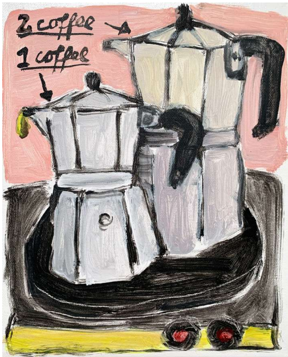
Katharina Arndt The 2 Coffee Pots , 2024 Acrylic on canvas 27 x 22 cm