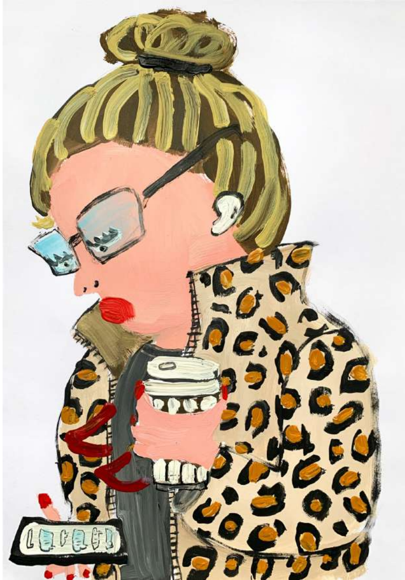
Katharina Arndt Leo Jacket + Coffee to go (sketch) , 2024 Acrylic on paper 42 × 29,7 cm