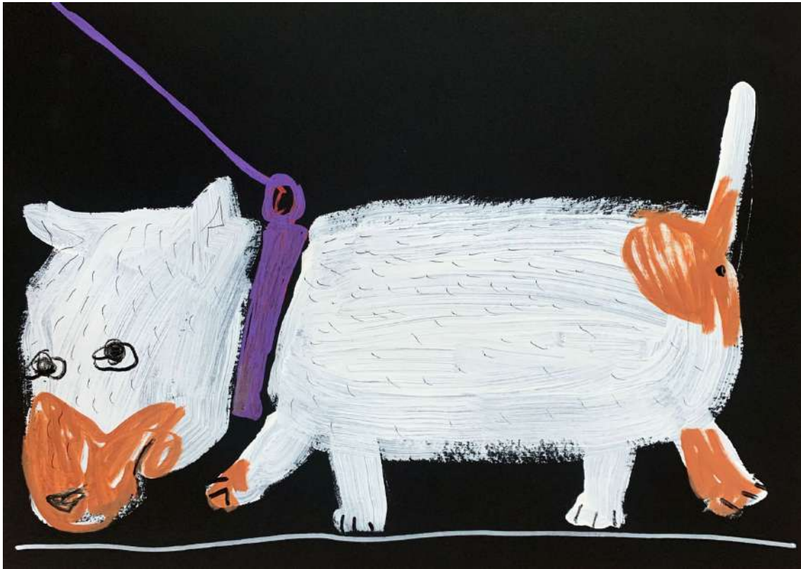
Katharina Arndt Depressed terrier (sketch) , 2022 Marker, acrylic paint, ballpen on paper 42 x 29,7 cm