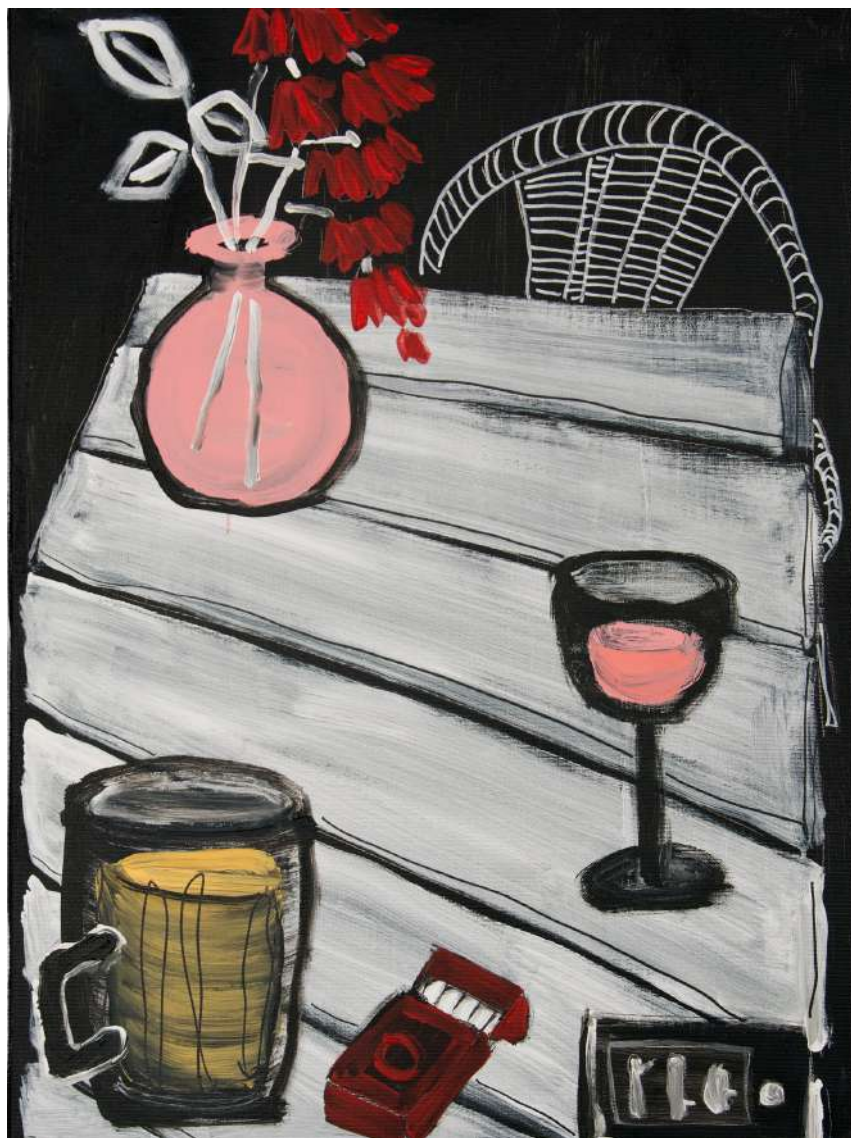
Katharina Arndt At "Tante Lisbeth" #2, 2024 Acrylic on canvas 85 x 60 cm