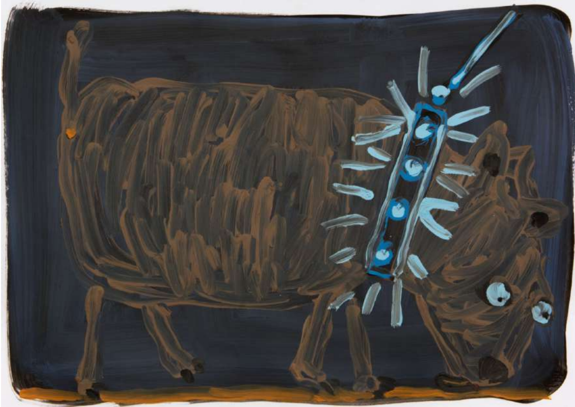
Katharina Arndt Dog at night , 2024 Acrylic on paper 42 x 59,4 cm