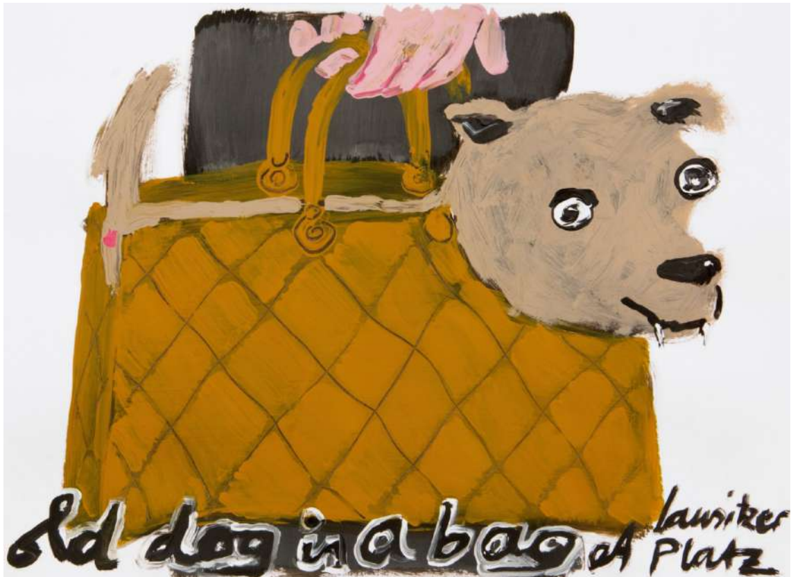
Katharina Arndt Old dog in a bag , 2024 Acrylic on paper 42 x 59,4 cm