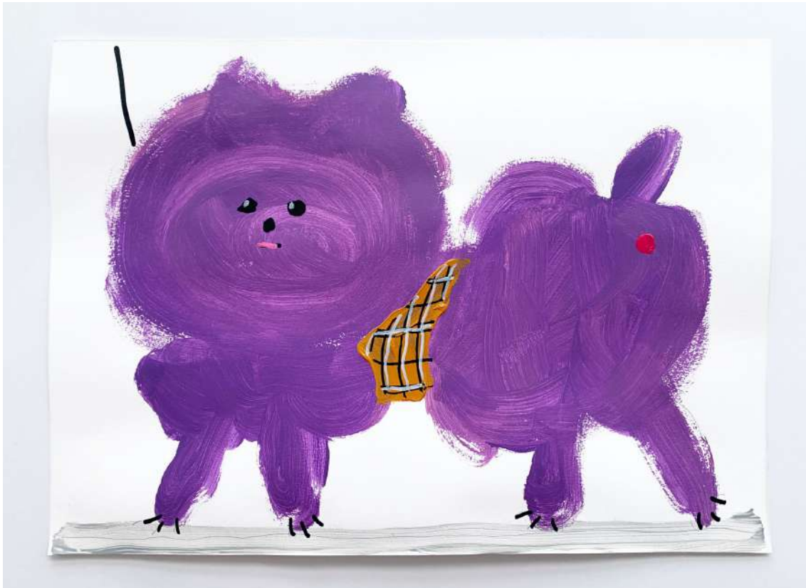
Katharina Arndt Fluffy purple dog (sketch), 2022 Acrylic paint, ballpen and marker on paper 42 × 29,7 cm