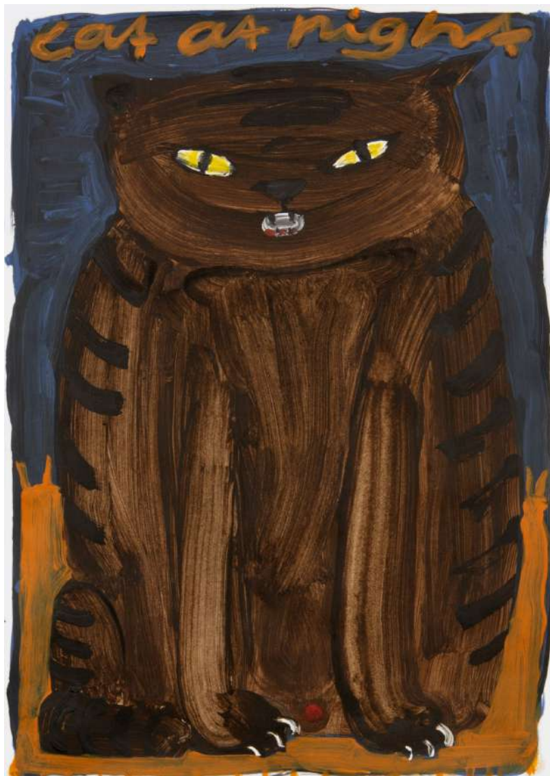
Katharina Arndt Cat at night , 2024 Acrylic on paper 59,4 x 42 cm