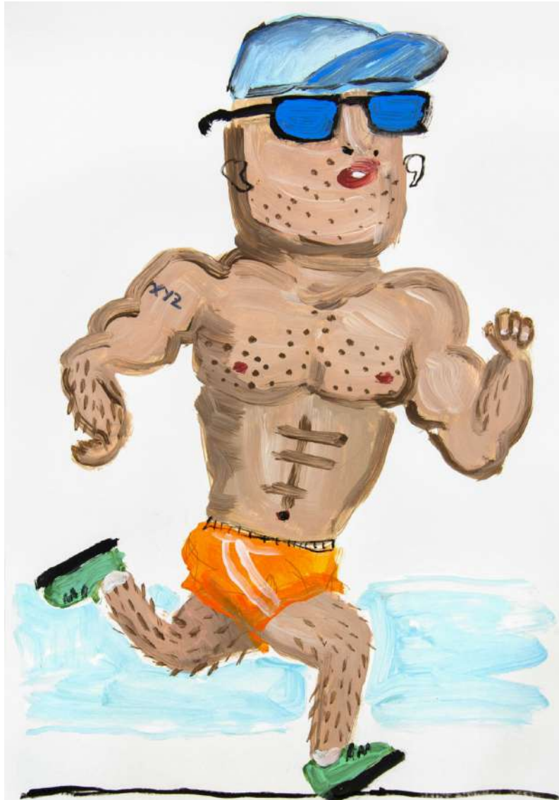
Katharina Arndt Take your shirt off , 2024 Acrylic on paper 42 x 29,7 cm