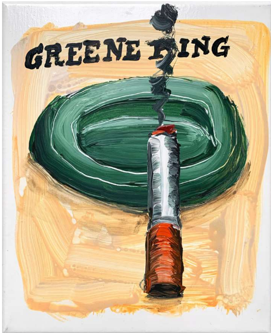
Katharina Arndt Greene King , 2024 Acrylic on canvas 27 x 22 cm