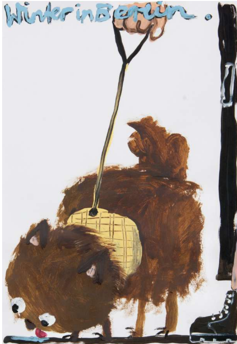
Katharina Arndt Winter in Berlin (with dog) , 2024 Acrylic on paper 59,4 × 42 cm