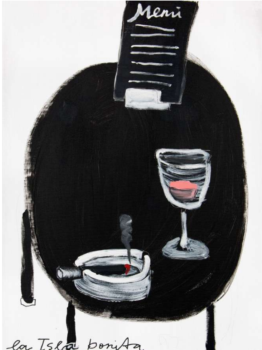
Katharina Arndt La Isla bonita , 2024 Acrylic on canvas 85 x 60 cm