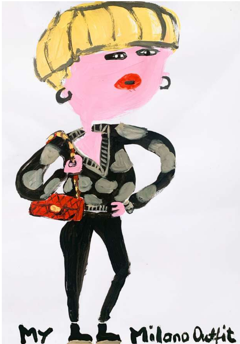
Katharina Arndt My Milano outfit (sketch) , 2023 Acrylic paint and marker on paper 42 x 29,7 cm