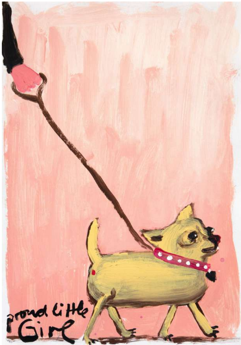
Katharina Arndt Proud little Girl , 2024 Acrylic on paper 42 x 29,7 cm