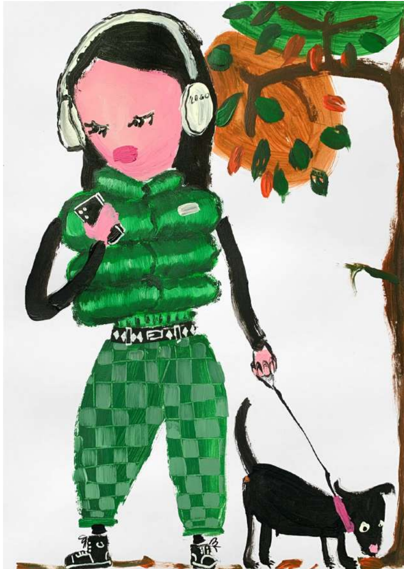
Katharina Arndt The green Outfit (sketch) , 2024 Acrylic on paper 42 x 29,7 cm