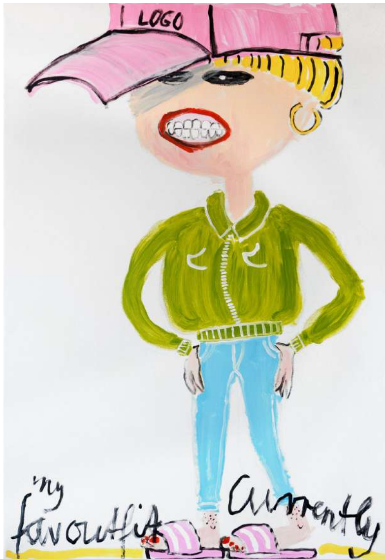
Katharina Arndt My Favorite Outfit Currently , 2022 Acrylic on canvas 180 x 125 cm