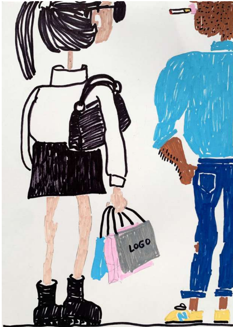
Katharina Arndt Shopping again at last (sketch) , 2021 Marker, acrylic paint, ballpen on paper 29,7 × 21 cm