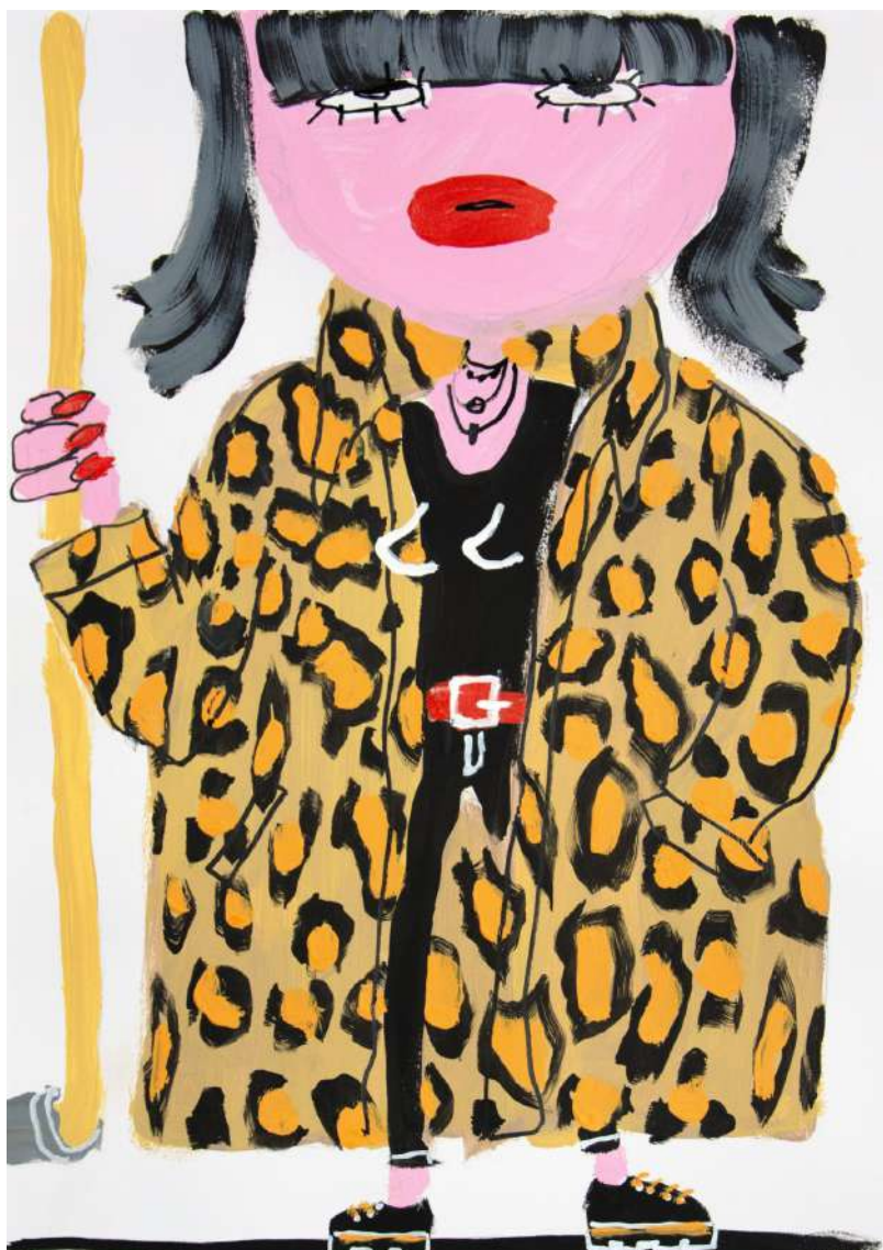
Katharina Arndt Cool outfit #2 (sketch) , 2022 Acrylic paint and marker on paper 42 x 29,7 cm