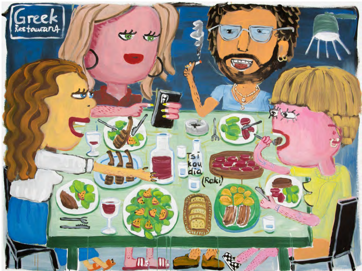
Katharina Arndt Greek Restaurant , 2023 acrylic paint on canvas 140 x 190 cm (55 1/8 x 74 3/4 inches) 7.200,00 €