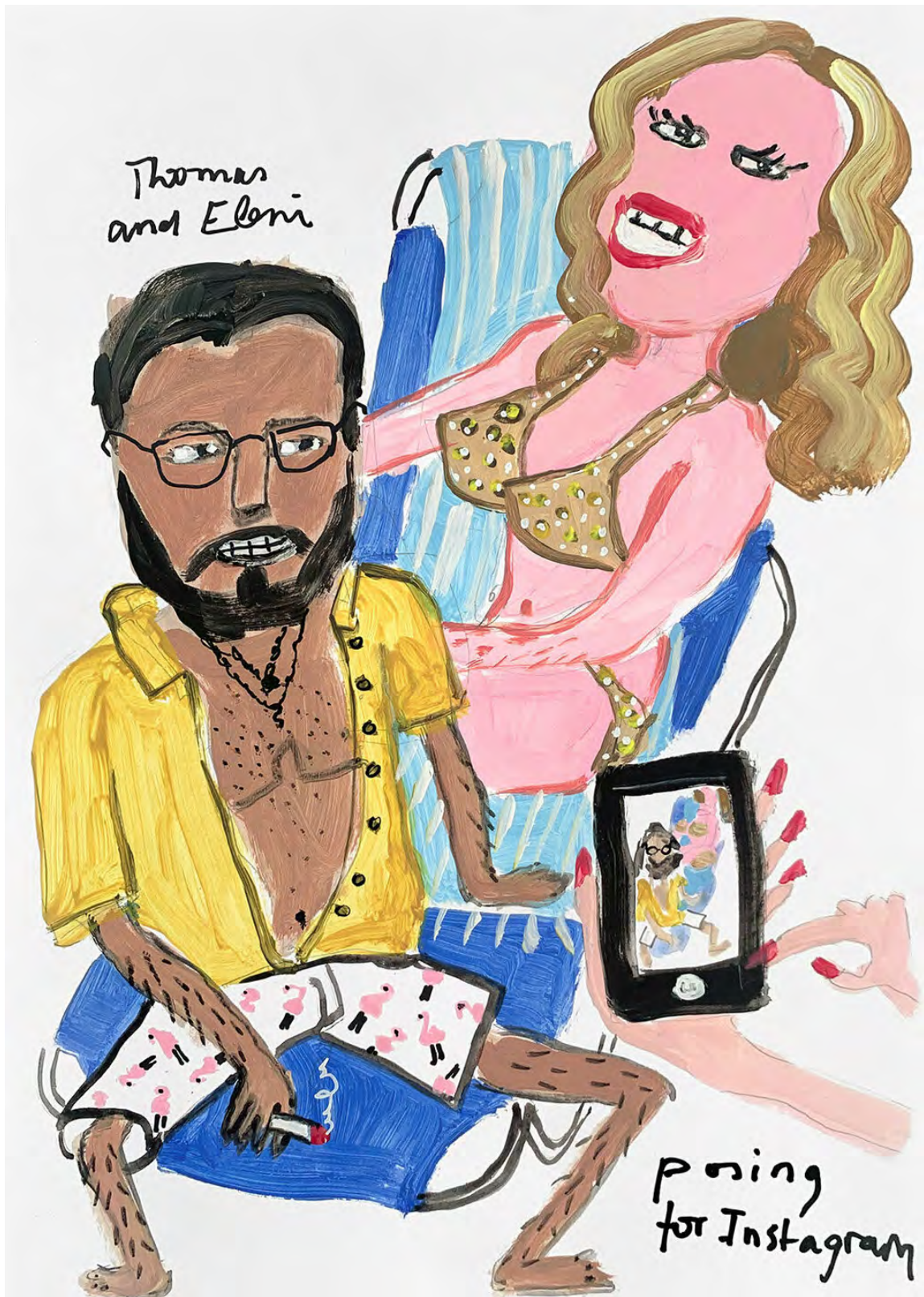
Katharina Arndt posing for Instagram (sketch), 2023 acrylic paint and marker on paper 42 x 29,7 cm (16 1/2 x 11 3/4 inches)