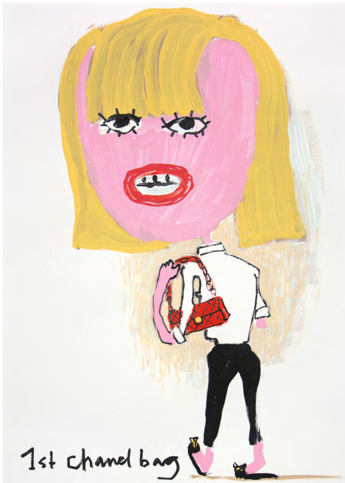
My 1st Chanel Bag, 2022 Acrylic Paint and Marker on Paper 42 x 29,7 cm (framed 48,5 x 37 cm) 790 €