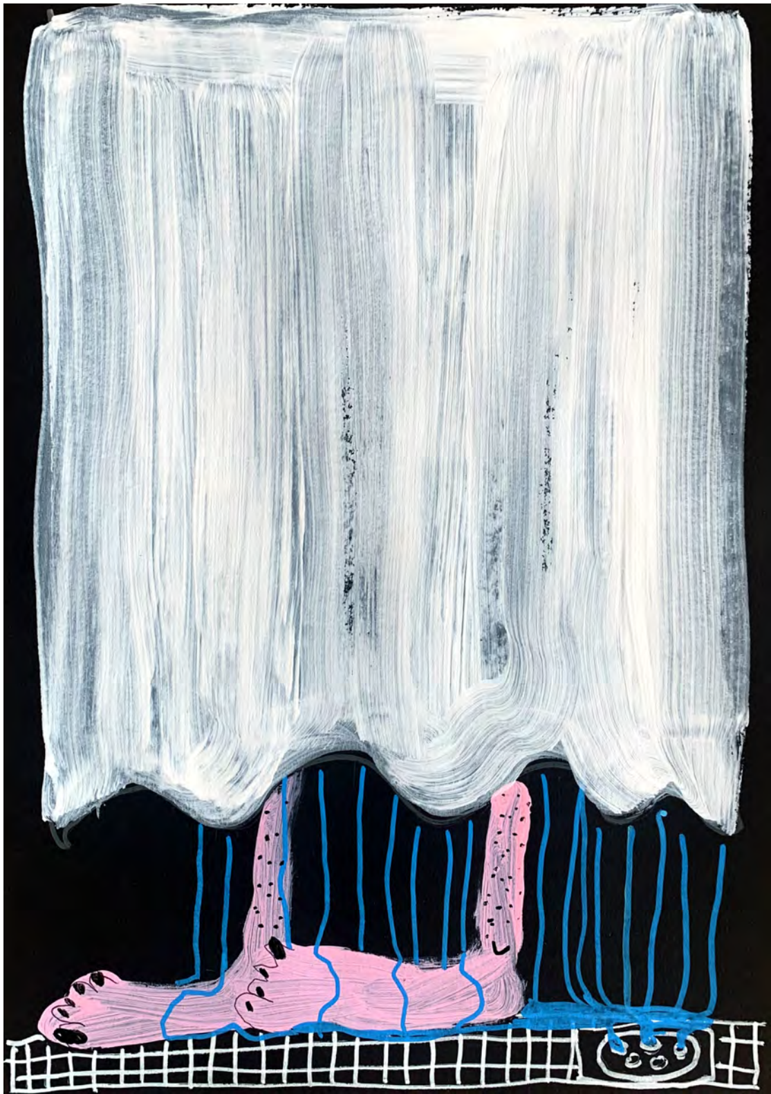
Me Having a Shower #2, 2022