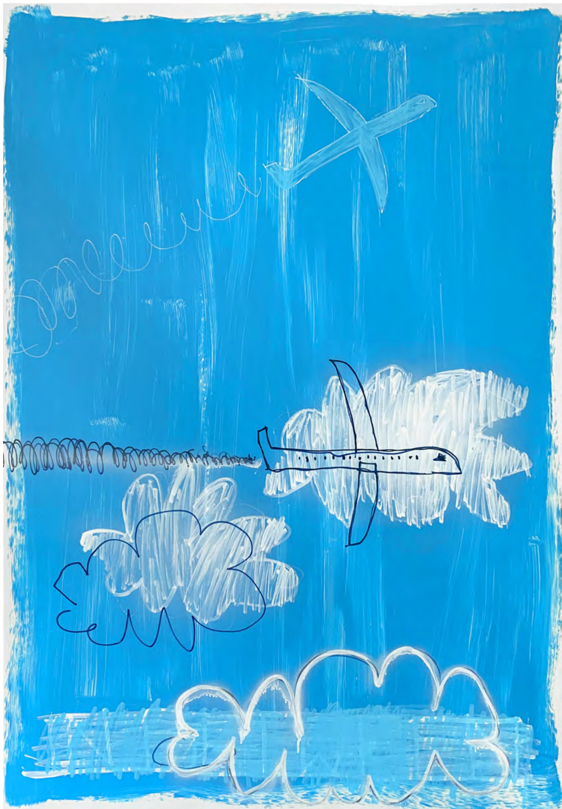
In Bewtween the Situps #3, 2021 Acrylic Paint and Marker on Lacquer Fabric 130 × 90 Cm 4.400 €