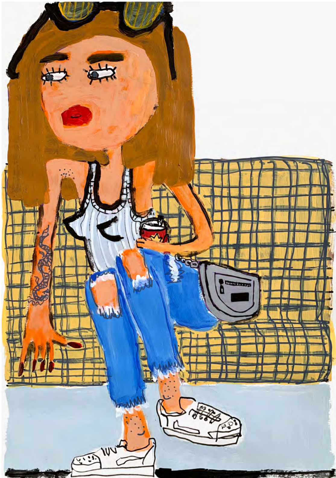
Message with Type Errors #2, 2022 Acrylic Paint and Marker on Paper 59,4 x 42 cm (framed 66 x 48,5 cm)