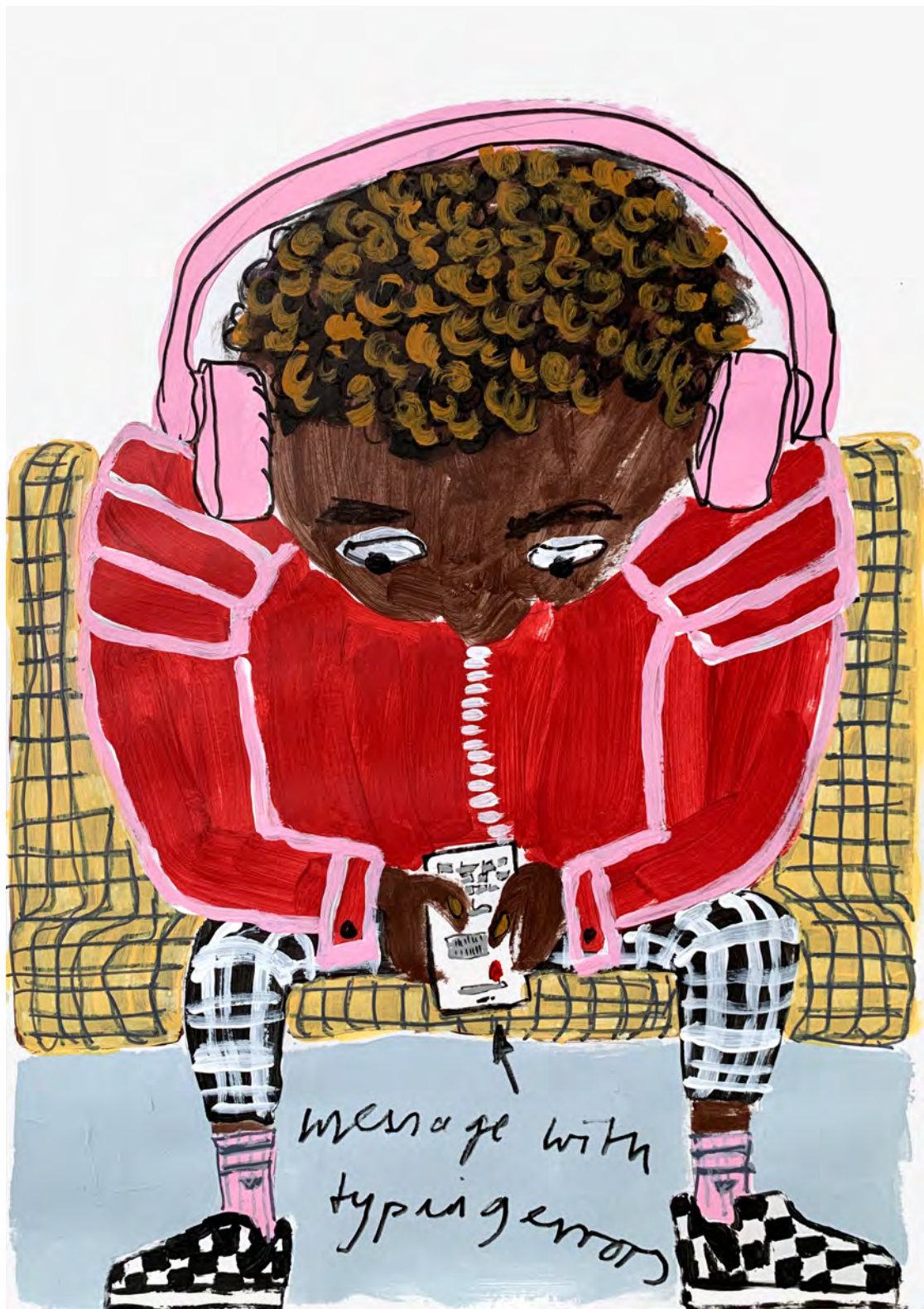
Message with Type Errors #1, 2022 Acrylic Paint and Marker on Paper 59,4 x 42 cm (framed 66 x 48,5 cm)