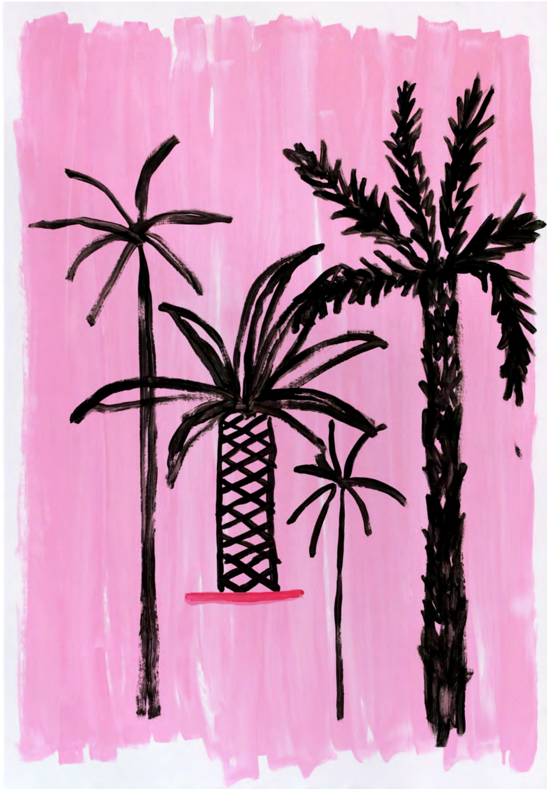
I Like Palmtrees, 2021 Acrylic Paint and Marker on Lacquer Fabric 130 × 90 Cm 4.400 €