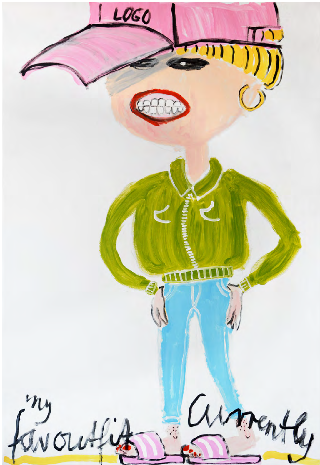
My Favorite Outfit Currently, 2022