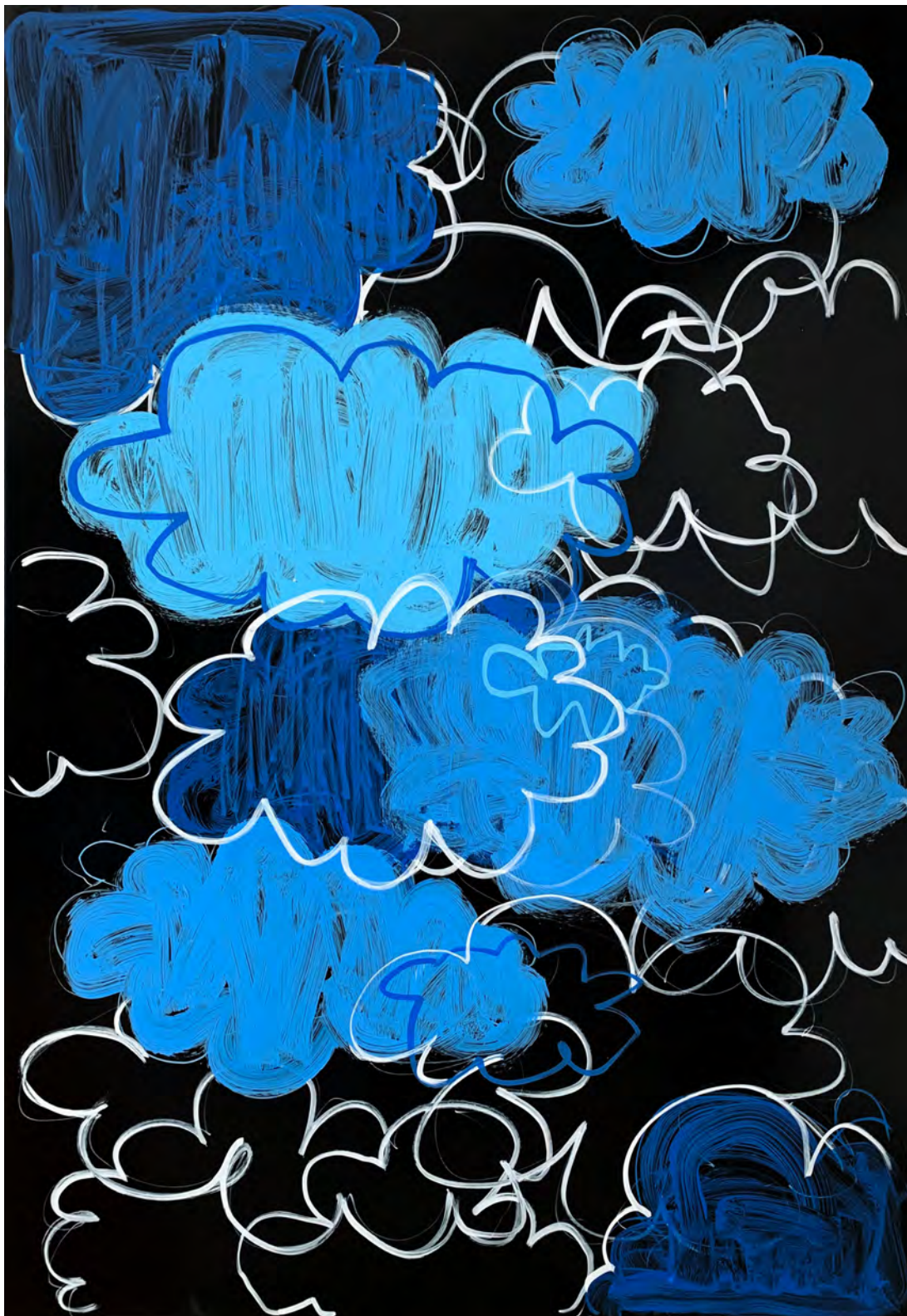
Cloudy Today #4, 2021 Acrylic Paint and Marker on Lacquer Fabric 130 × 90 Cm 4.400 €