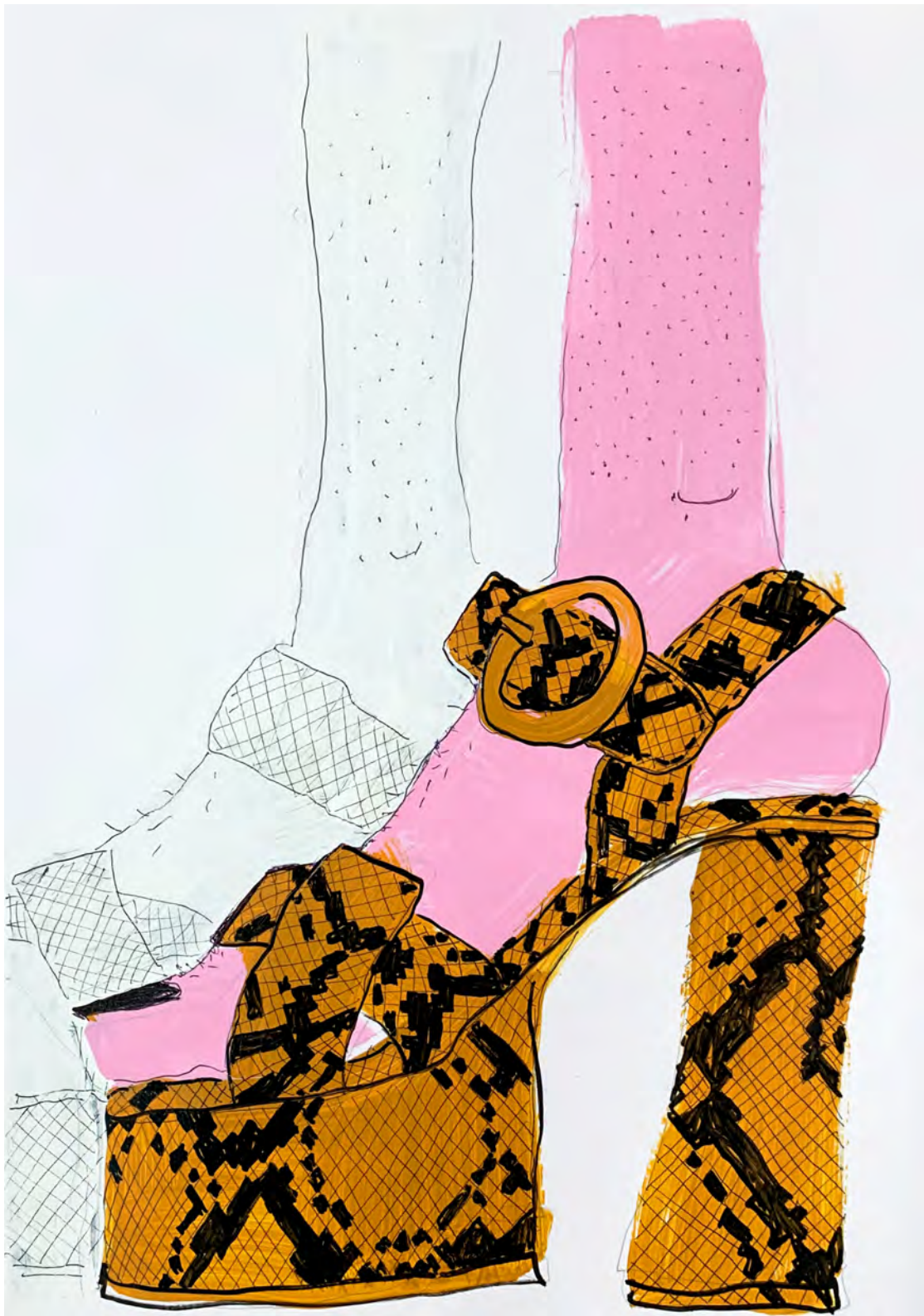
Feeling Hot, 2022

Acrylic Paint and Marker on Paper 42 x 29,7 cm (framed 48,5 x 37 cm)