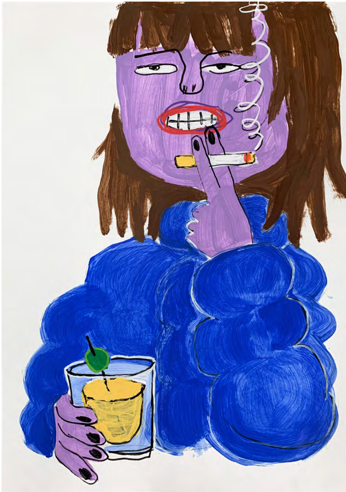
Florence Having Another Vermouth , 2022 Acrylic Paint and Marker on Paper 42 x 29,7 cm (framed 48,5 x 37 cm) 790 €